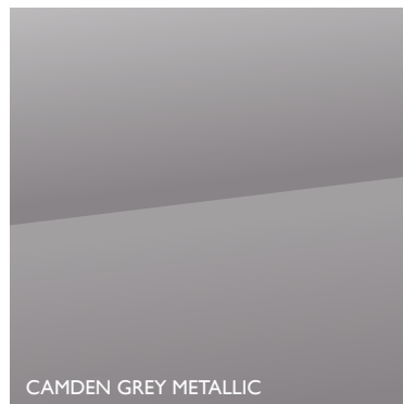
CAMDEN GREY METALLIC