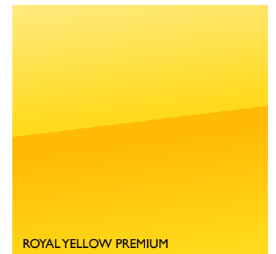
ROYAL YELLOW PREMIUM