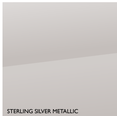
STERLING SILVER METALLIC