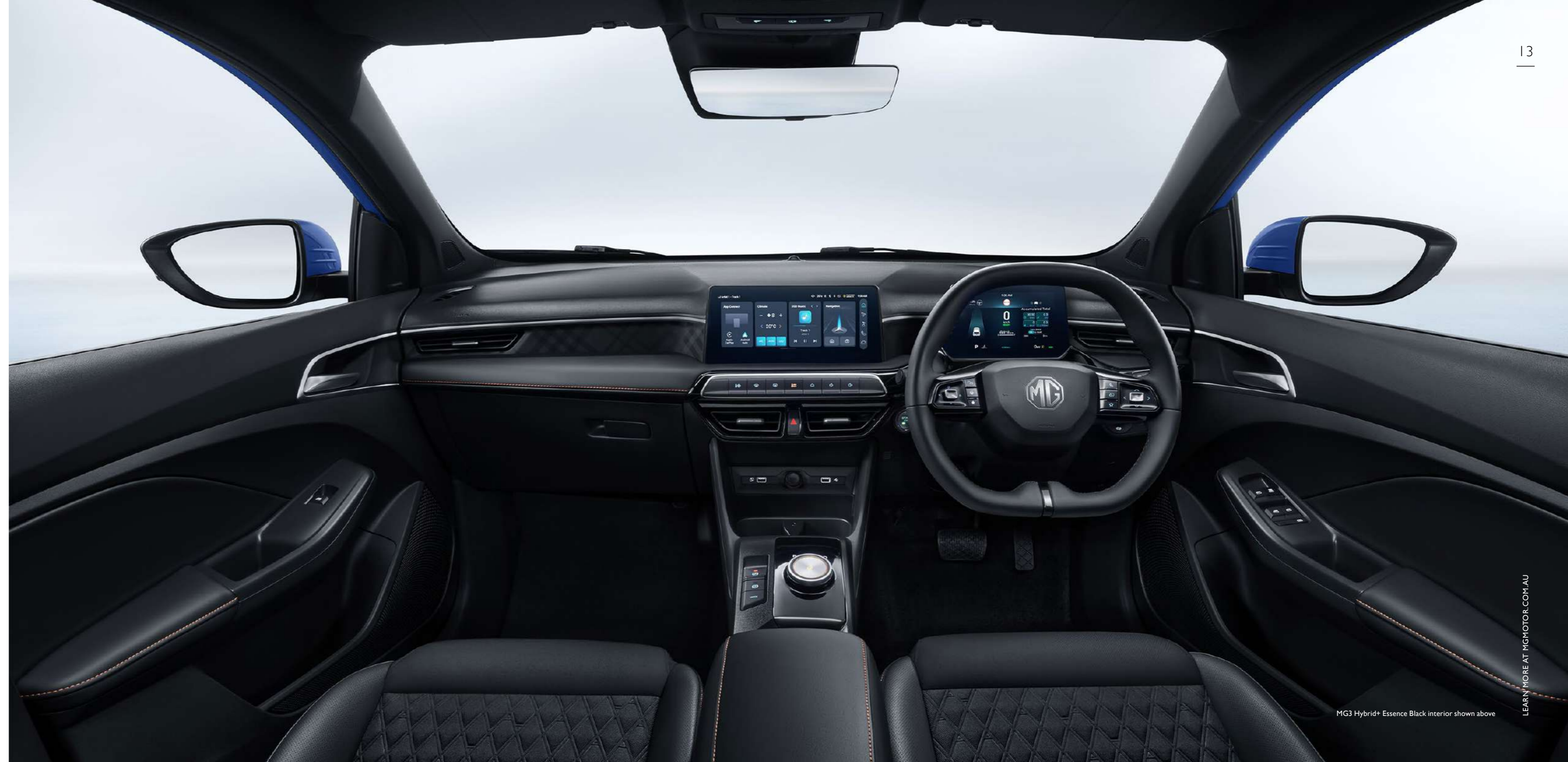
MG3 Hybrid+ Essence Black interior shown above