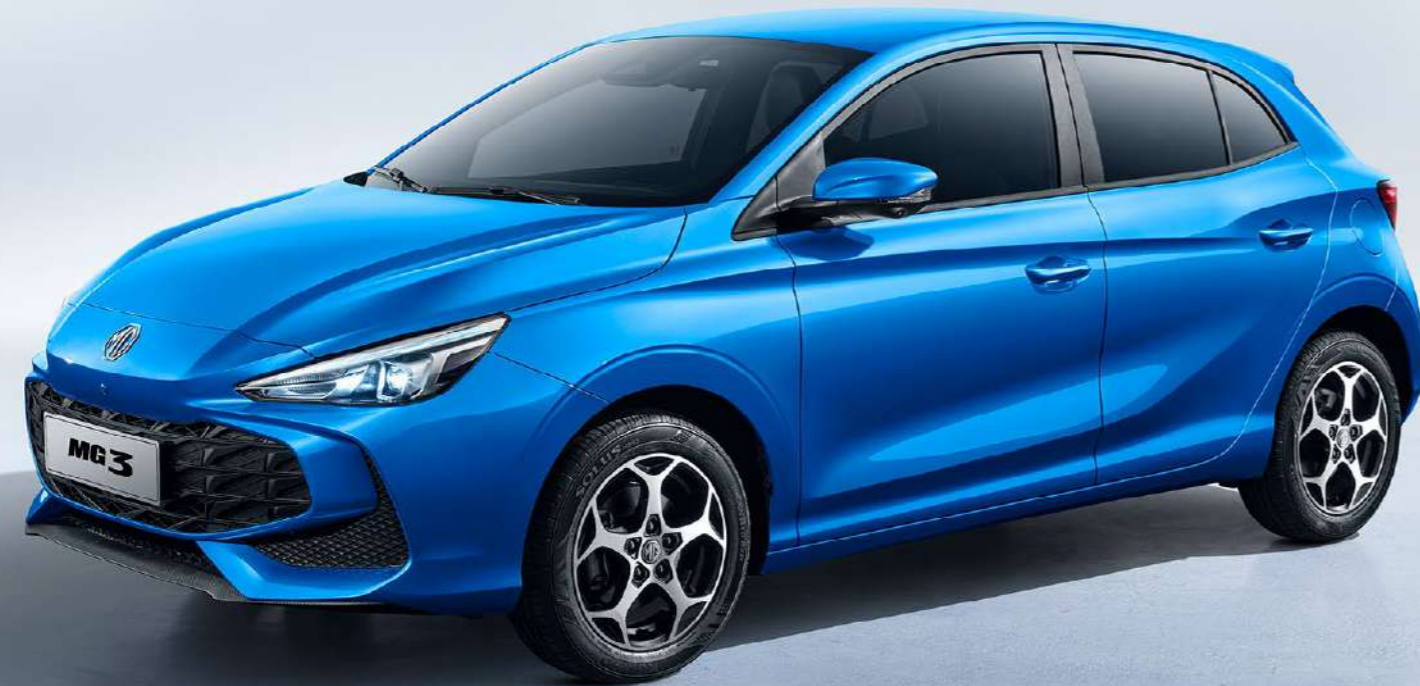
BRIGHTON BLUE METALLIC

Colours in this brochure may vary to those on the vehicle. White interior only available on MG3 Hybrid+ Essence for Brixton Blue Metallic, Black Pearl Metallic, Sloane Silver Metallic and Hampstead Grey Metallic colours.